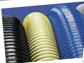
Wood chip/mulch ducting and suction hose.

Whether you need a complete conveyor or replacement parts HCI is here for you. From screw conveyor to belt conveyors. From PT products to pulleys and rollers. Fabricated belting with cleats and lacing for your repair needs.